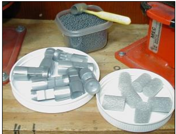
Wads, Shot and Foam Rod Sections