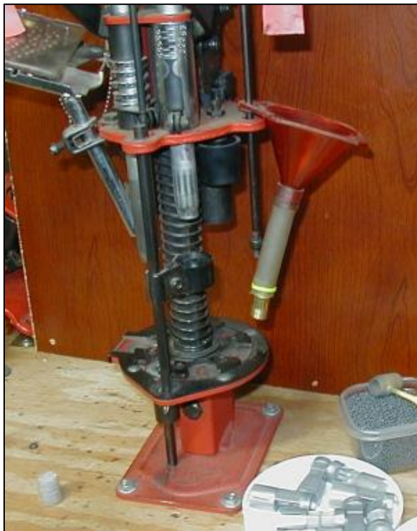
Press with Shot Funnel attached

These loads do a fine job to taking down all our KDs and at the same time keep me from helping to pay for my doctor's new Porsche (the 911 Carrera starts out at $101,200 and goes up from there 🤖 )