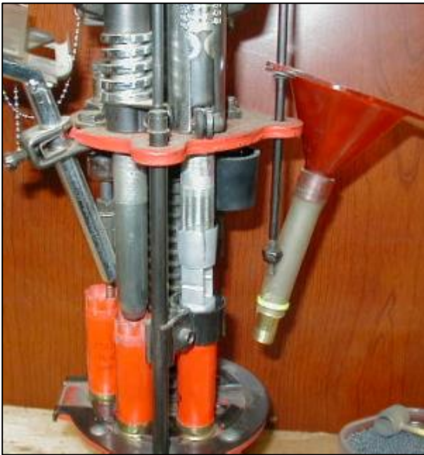
Stage 3: load Wad but no Shot