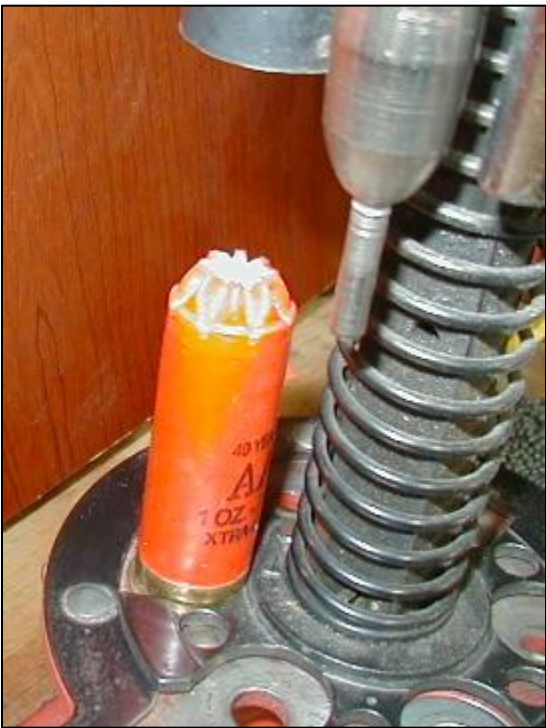
Before Final Crimp