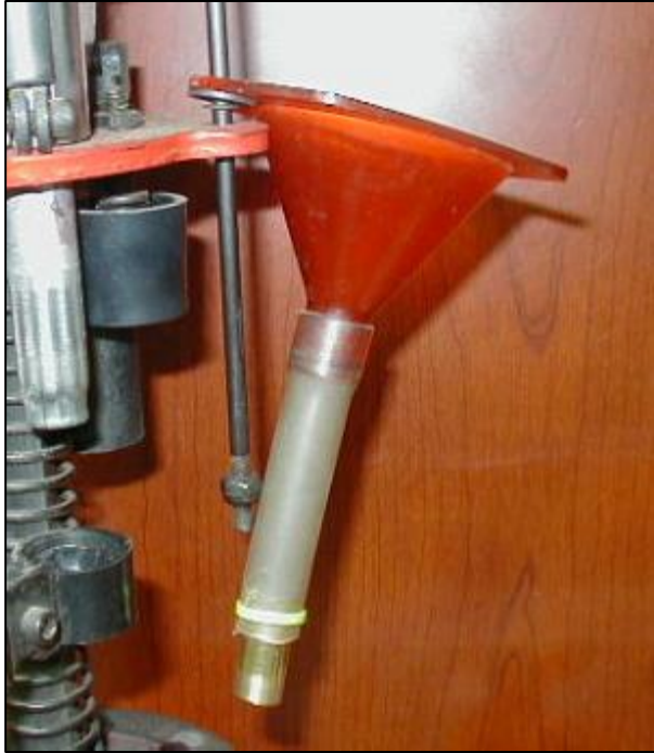
Close-up of Funnel