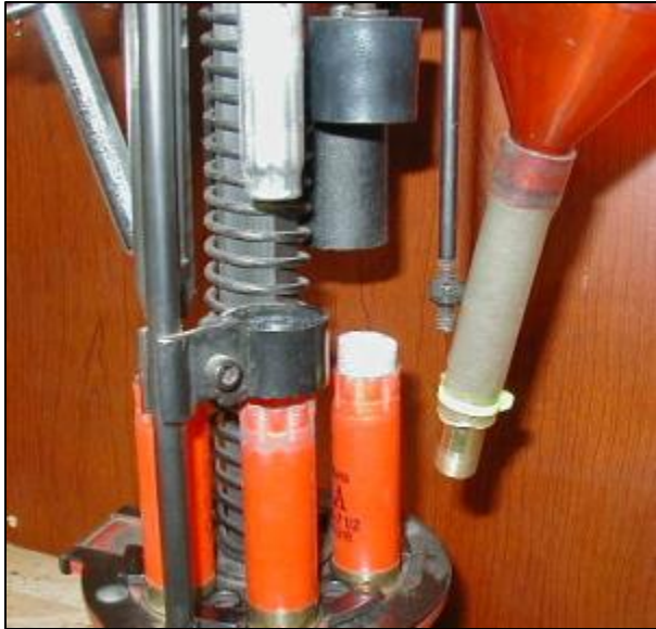
Foam Rod added at Stage 4 before operating press