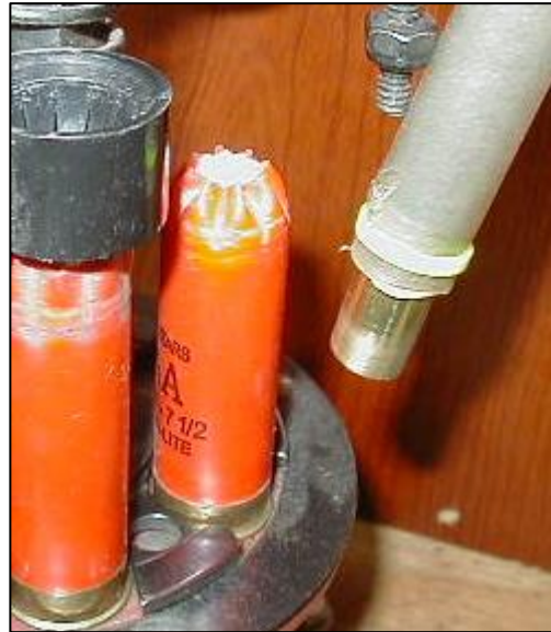
After Stage 4 press operation