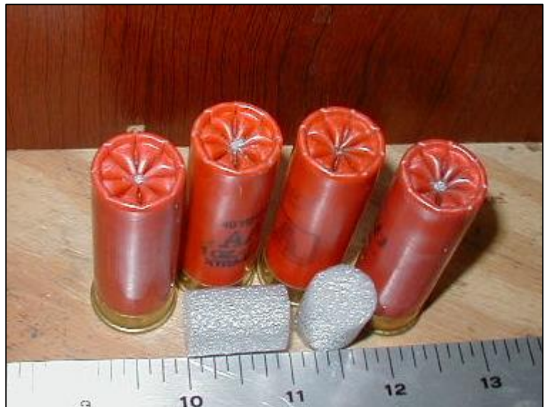
Final Results; depending on the age of the hulls, the crimp may be pushed in more than usual. This does not affect its power