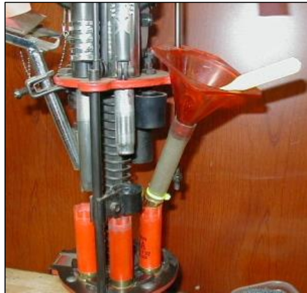
Stage 3½: Loading Shot--end of dipper showing in funnel