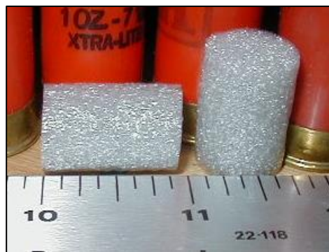
Foam Rod: this one is \frac{5}{8} " dia by \frac{5}{8} " long

Now, here is the major part of the process that allows for a decent crimp: on top of the shot load a place a \frac{5}{8} " or \frac{3}{4} " diameter, \frac{5}{8} " long foam backing rod; both diameters will work. This will extend above the hull but don't worry. (Note: you can "play" with length of the rod to fine tune the crimp—since it didn't affect the power or loading of the shells, I never pursued it)