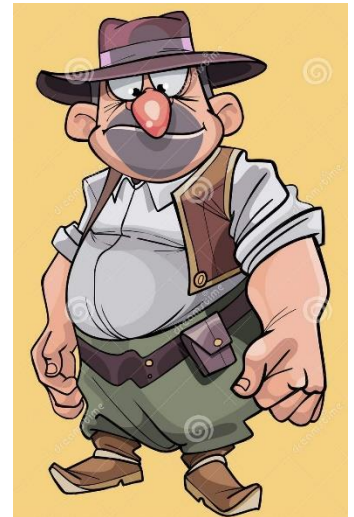
My Body--on a Good Day