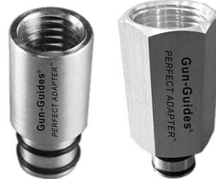
The Perfect Adapter™