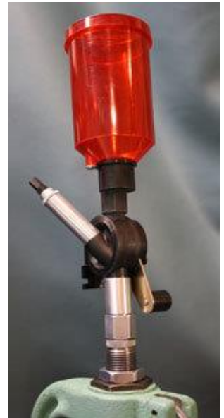
Complete set up

Lee Bullet Molds (Moulds) are more of a DIY Kit: if you are into the high pressure, big stakes world of bullet casting you know the cost of molds vary greatly. At one end you can pay in excess of $150 for a 2-cavity custom creation while at the lower end of the price range sits Lee Bullet molds in 2- and 6-cavities.