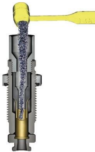
Lee thru die

They also have one that for any powder measure with 7/8 x 14" threads. As always, I am but a happy customer and not associated with the company in any other way. Their website is https://gun-guides.com/Perfect-Reloading-Powder-Measure-Adapters%E2%84%A2-for-LEE-Powder-Through-Dies-c23094183