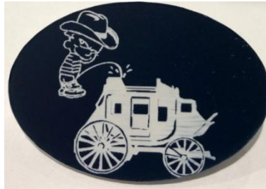
←TRR's new Procedural Pin