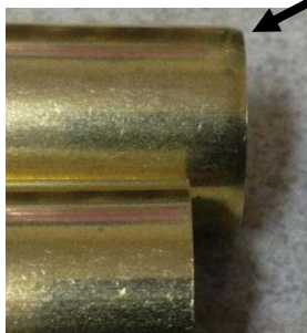
Slight Crimp on Left

I use it on a Lee Classic Cast press and the thickness of the top cross piece means the lock not can’t be used—doesn’t let the crimp right come down far enough. I fabricated a nylon washer as a stop-gap but will be looking for a thinner nut for a permanent solution.